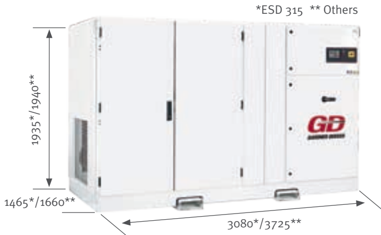
*ESD 315 ** Others

** Measured in free field conditions in accordance with ISO2151, tolerance +/-3dB