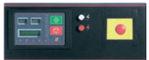
Gardner Denver's advanced DigiPilot user interface